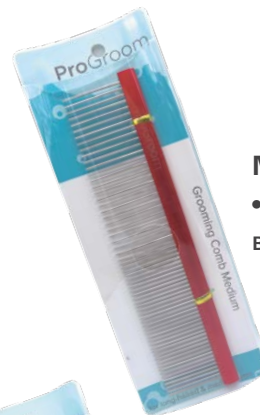
Medium Grooming Comb