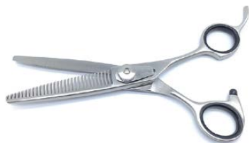
6" With Teeth