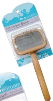
Small Pet Slicker Brush