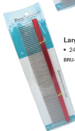
Large Grooming Comb