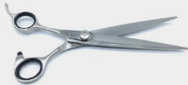
7.5" Left Hand Straight SCI-06-75SL