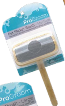
Medium Pet Slicker Brush