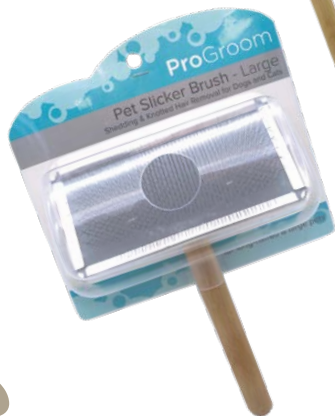
Large Pet Slicker Brush