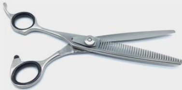
6.5" Left Hand With Teeth SCI-08-65WL