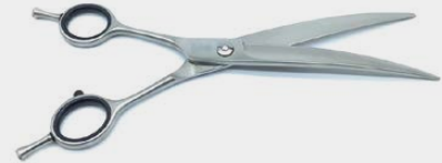
7.5" Left Hand Curved SCI-07-75CL