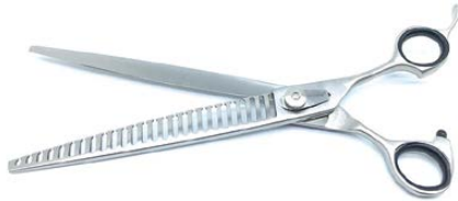
8" With Teeth SCI-05-8FT