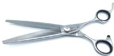
7" With Teeth